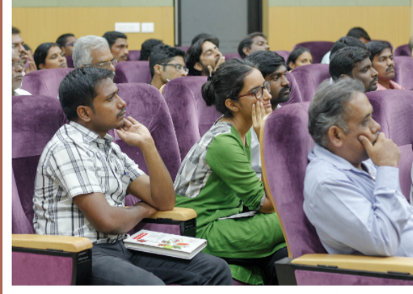
Capacity Buiding Program for POPIs