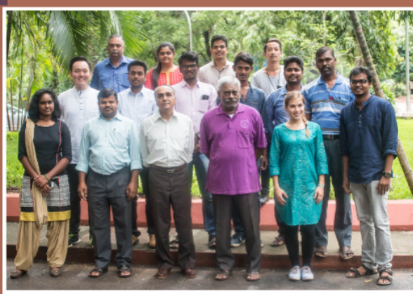
International Summer School on Social Entrepreneurship