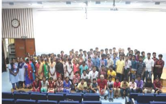
Summer Camp for School Students