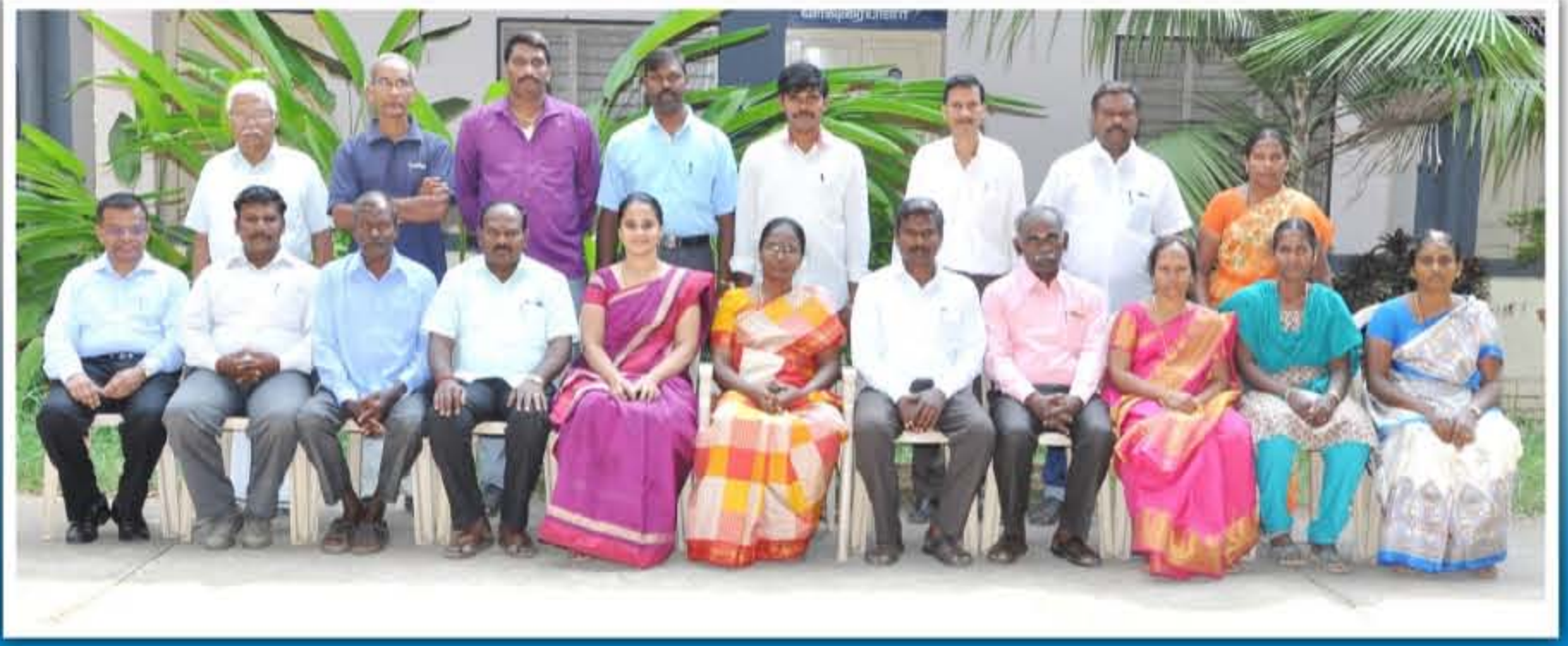
Capacity Building Program for Farmer Producer Organisations (FPOs) in February at Bhavanisagar, Erode, Tamil Nadu.

மண்டல உணரக வளர்ச்சி மற்றும் உடராட்சித்துறை நிறுவனம் - பவானிசாகர் உழவர் உற்பத்தியாளர் நிறுவனங்களுக்கான திறன்மேம்பாட்டு பயிற்சி ஈரோடு, கோவை, திருப்பூர், நீலகிரி, கரூர், திண்டுக்கல், அரியலூர் & பெரும்பலூர் மாவட்டங்கள் பயிற்சி காலம் 27.02.2019 முதல் 28.02.2019 வரை