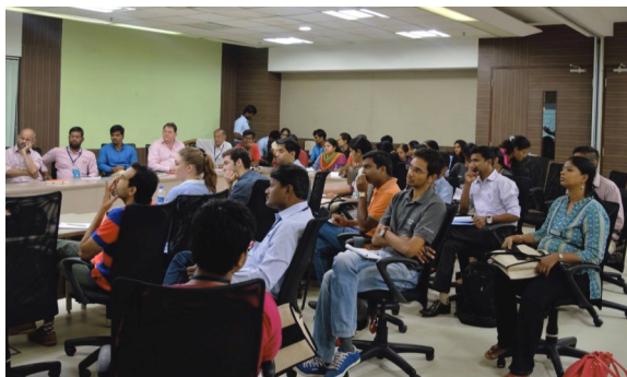
Participants during one of the sessions of UKISEEN Conference

As part of the Social Enterprise Education Programme, an initiative of the British Council, CSIE and University of Southampton jointly conducted an international conference, UK India Social Entrepreneurship in Education Network, to promote collaboration and best practice in social entrepreneurship teaching between UK and Indian universities. Faculties and students from all over India and UK attended the conference, held from 15-16 April 2016 at IIT Madras Research Park. A field visit to Kuthambakkam village was also conducted as part of the conference.