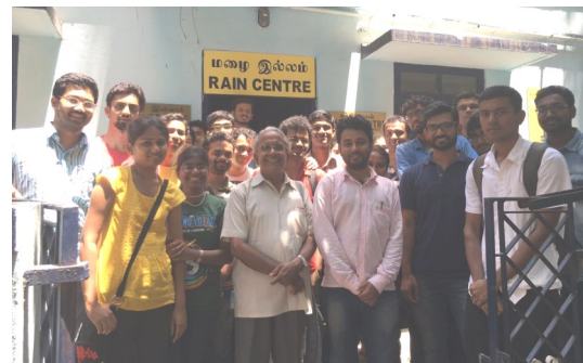
Group photo of students at the Rain Centre

The Social Entrepreneurship club organized a field trip to the Rain Centre at Santhome on 3rd April 2016. Around 20 students participated in the visit. The Rain Centre is a non-profit Organization that is mainly aimed at spreading awareness about the need, relevance, importance and benefits of rain water harvesting. The students got a chance to see working models and the different methods that are employed to harvest rain water.