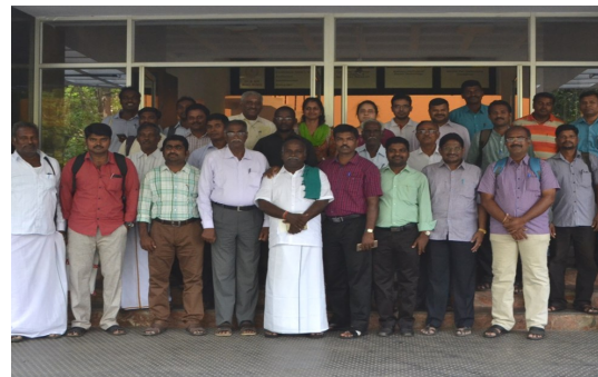
Group photo of the participants from various FPOs

CSIE conducted Capacity Building Program for Farmer Producer Organizations (FPOs) from 20 - 21 May 2016 at IIT Madras. The objective of the workshop was to give the participants a theoretical understanding of the management, perspectives on market development, governance, financial issues and other legal and insurance related issues.